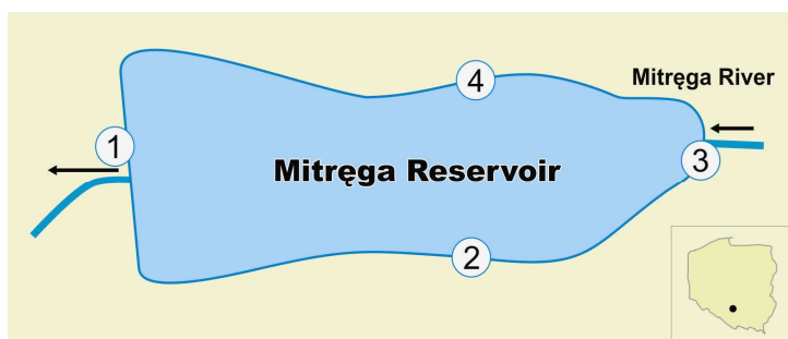
Fig. 1. Location of the Mitręga Reservoir with the sampling points (Poland)

Bottom sediment samples were collected from the surface layer of the sediment, to a depth of 5 cm, in June 2013 at 4 sites (Fig. 1). Sampling points were located in a way to show the distribution of contaminants in different locations of the Mitręga reservoir. The first sampling point was located on the western side of the reservoir, near the outflow of the Mitręga river, the second on the southern shore. The third sampling point was located on the eastern side of the reservoir, near the tributary of the Mitręga river, and the fourth in the northern part, near the beach. The sediments were collected at a distance of 1.5-3 m from the shore. The level of water to the surface of the sediment layer was about 0.5-0.6 m.