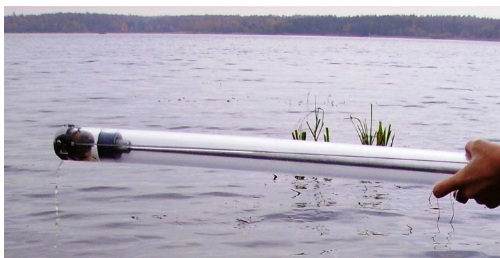
Fig. 2. Tube sampler for bottom sediments sampling