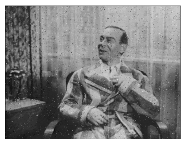
Fig. 15. Frame restored using the 3DGUMM filter with motion detection.