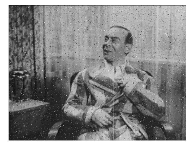
Fig. 14. Frame restored using the 3DTMM filter.