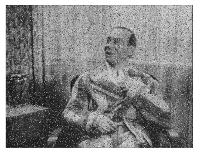
Fig. 16. Frame restored using the two-level multistage median filter with motion detection.