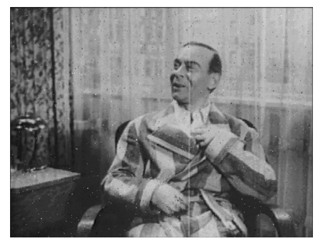
Fig. 13. Frame restored using the 3D+++ filter with motion detection (all four neighbors), T = 0.2.