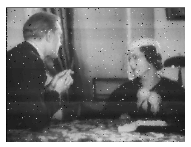
Fig. 5. 3DX+X filter with m.d. by using the current pixel only with T = 0.05.