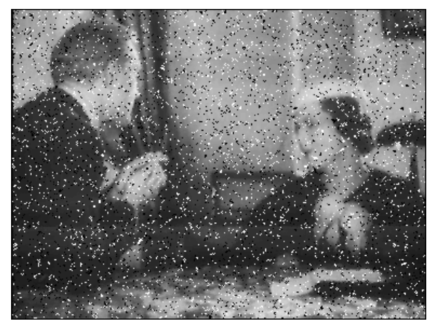
Fig. 9. 3DUMM-lev2 filter with m.d. by using the current pixel and at least one neighbor, T = 0.2.