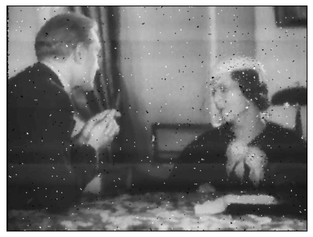
Fig. 4. 3DX+X filter with m.d. by using the current pixel and at least one neighbor, T = 0.05.