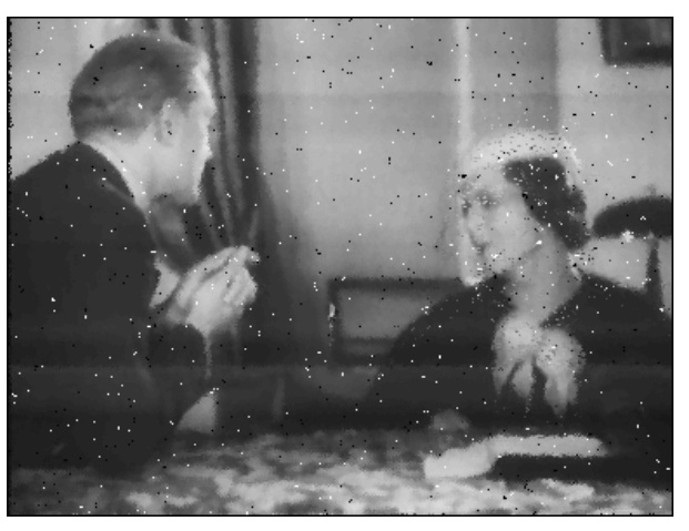
Fig. 6. 3DXXX filter with m.d. by using the current pixel and at least one neighbor, T = 0.05.