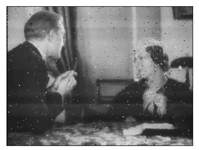
Fig. 8. 3D+++ filter with m.d. by using the the current pixel and at least one neighbor, T = 0.2.