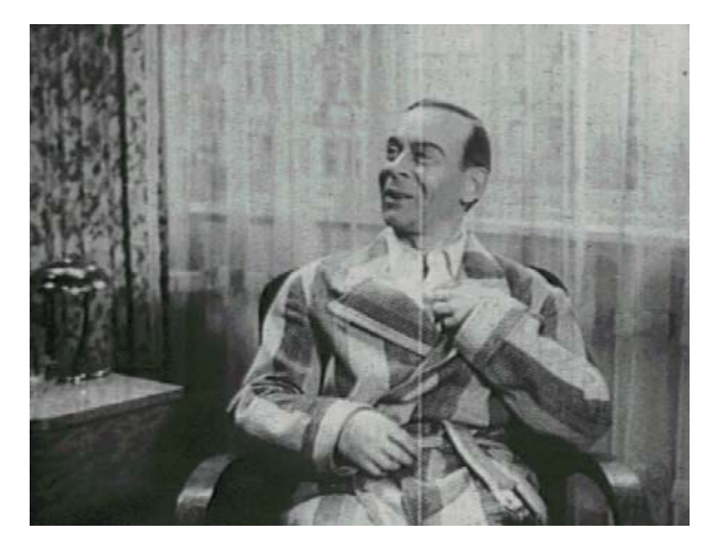
Fig. 11. Original frame.