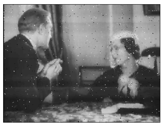
Fig. 7. 3D+++ filter with m.d. by using the current pixel and at least one neighbor, T = 0.05.