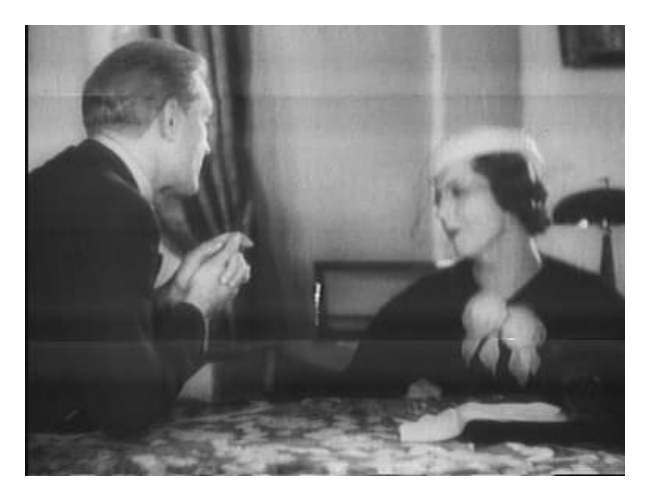
Fig. 1. Original frame.