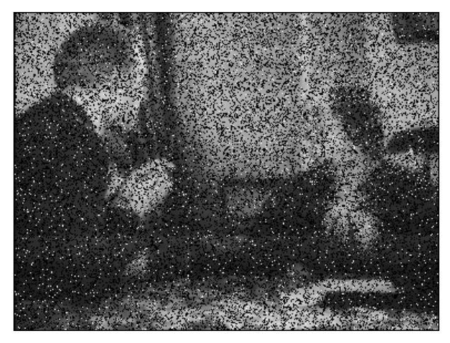
Fig. 10. 3Dclose-open filter with m.d. by using the current pixel and at least one neighbor, T = 1.2.