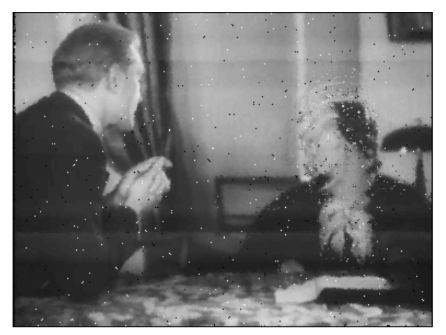
Fig. 3. Results after applying the 3DX+X filter without motion detection.